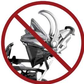
CAR SEAT WRONG

For the most updated list of compatible infant car seats, please either check our website at www.joovy.com or call our Customer Service Department at (877) 456-5049.