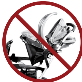
CAR SEAT WRONG