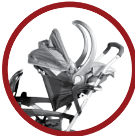
CAR SEAT CORRECT